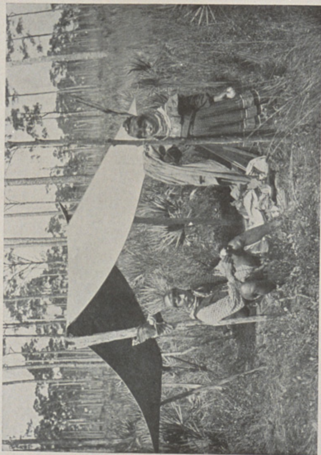
Their Homeless Condition Is Pathetic. Soon They May Hear the White Man's Cry, "Move on, Move on."