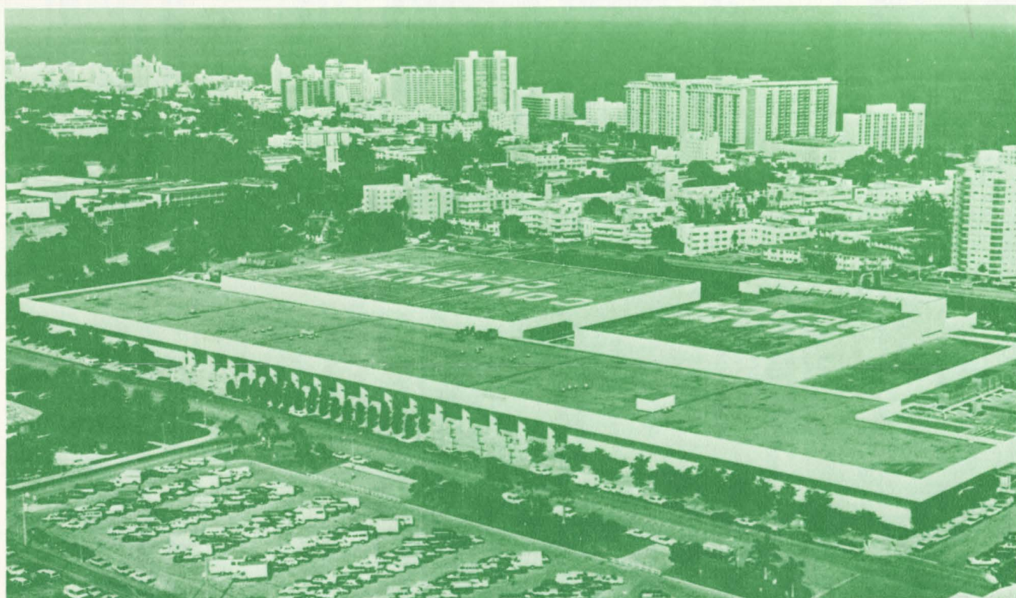
MIAMI BEACH CONVENTION CENTER