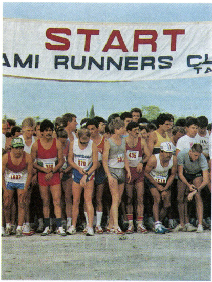
On your mark, get set, go