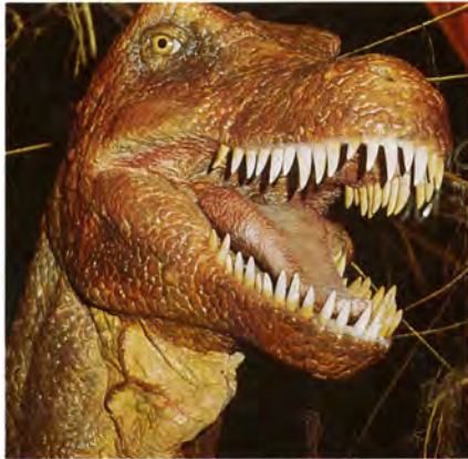
"Tyrannosaurus" from the Museum of Science

DINOSAURS ARE BACK... at the Miami Museum of Science. Eight fierce creatures will move and growl in a primordial forest setting from February 4-April 30 in a glimpse of life 150 million years ago. A life-sized baby Apatosaurus joins its mother this year, along with the dinosaur king, the Tyrannosaurus, as well as a Pachycephalosaurus, Triceratops, Pterandon, Dimetrodon and Stegosaurus. Discover different theories of what may have caused the dinosaurs' extinction at the planetarium show.