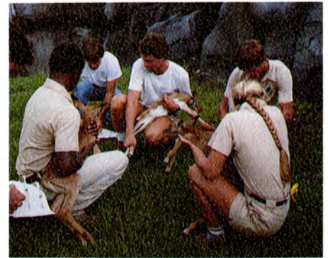
Keepers assist with newborn impala.

We are extremely fortunate in having a dynamic and dedicated keeper staff here at the zoo. Their energy and devotion to the animals help to make Metrozoo the world class zoo that it is.