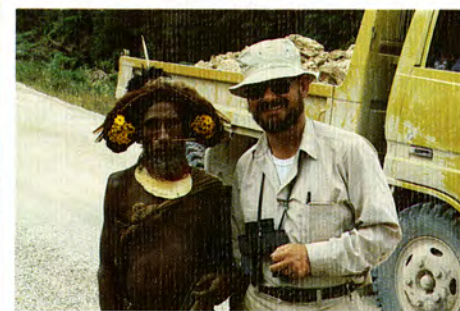
On the road to Tarri with Southern Highlands Wigman.