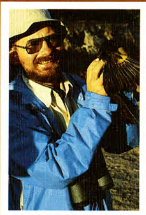
A bird in the hand...a rare female Archibald's Bowerbird.

P apua New Guinea is a bird lover's paradise. The exotic and gorgeous birds native to New Guinea are rarely exported out of the country, so it was a proud moment when Metrozoo was included in a collection expedition to that country in cooperation with such major-league zoos as the Bronx Zoo, San Diego Zoo, Los Angeles Zoo and the Dallas Zoo.