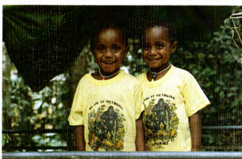
Gifts of goodwill from the Zoological Society.