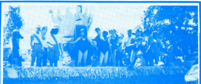
"Positions everyone . . . the parade is about to start!", was shouted at the St. Patty's Day Parade.

Her job entails handling all of the planning and implementation of the Society's educational services and the education program. Currently she is working with the Dade County Public School System to provide educational programs for students.