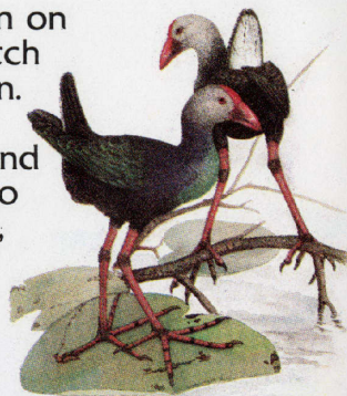
PURPLE SWAMP HEN

You're seeing them on their terms. So watch carefully. And Listen. Look up. Look around. Observe and help the children to observe. Above all, be patient. As you become a part of their world,