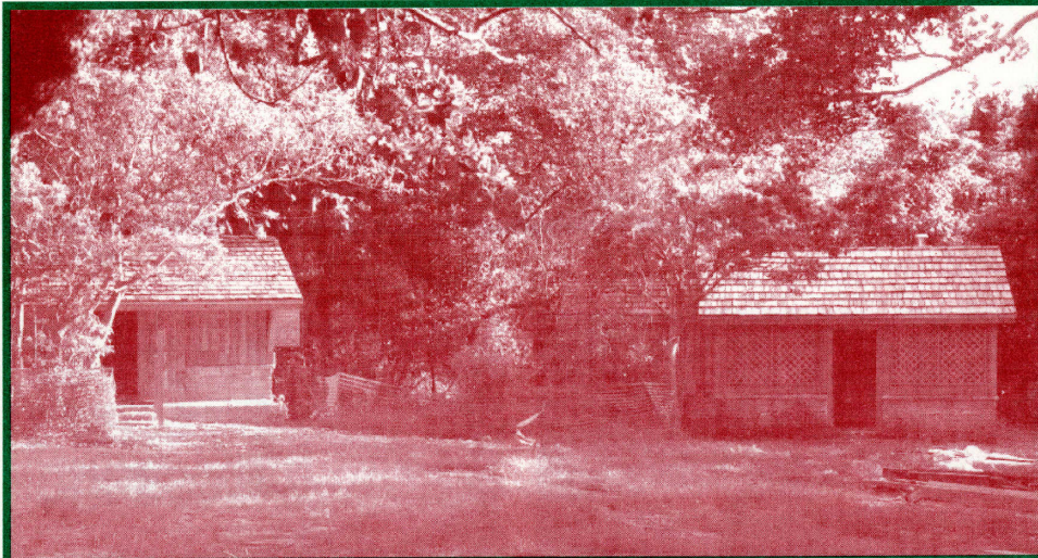
Cabins under renovation at Greynolds.