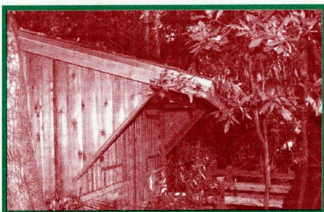
Side view of cabin.

The project involves the preservation, restoration and rehabilitation of nine cabins, one washroom building and a dining hall with adjoining kitchen and toilet areas. The cabins were dismantled by hand in order to salvage any usable material for the restoration of these historic buildings. The timber framing members, wall cladding and roof framing for cabins two through nine were removed, leaving only concrete super structure as a base for reconstruction. All reusable materials recovered from dismantling the cabins was stored for reuse on cabin number one. The camp supervisor's cabin, cabin one, has been preserved as an historic record of the original character and construction of the cabins.