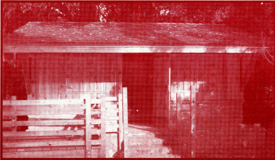
Front view of one of the renovated cabins.