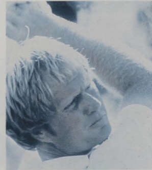
Jack Nicklaus Ohio State '61