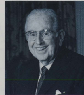
Norman Vincent Peale Ohio Wesleyan '20