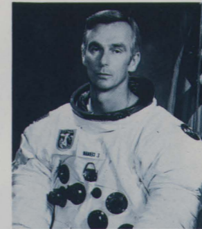
Gene Cernan Purdue '56