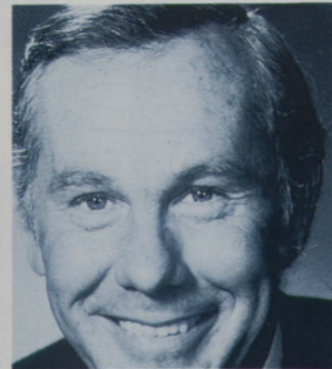
Johnny Carson Nebraska '49