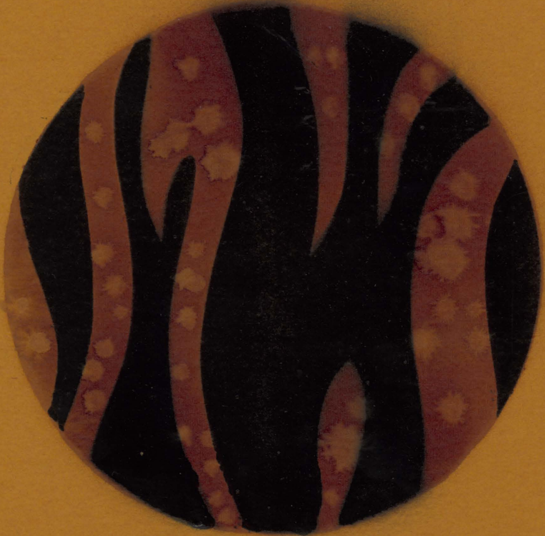
FIG 10 COVER 3