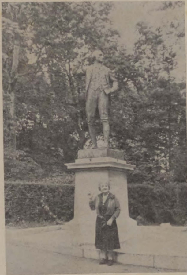
MANA ZUCCA, the famous musical composer, standing before the Thomas Paine Statue in Paris, France. She was a child prodigy at the age of three—and played in nearly all the capitals of Europe before the age of six. She is the author of the famous song, I LOVE LIFE, and more than 1300 musical compositions.

that I was privileged to hear it. I was thrilled by every note your skillful, marve- lous fingers recorded.