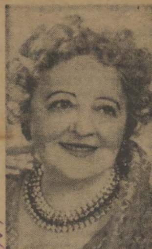
MANA-ZUCCA Versatile Composer