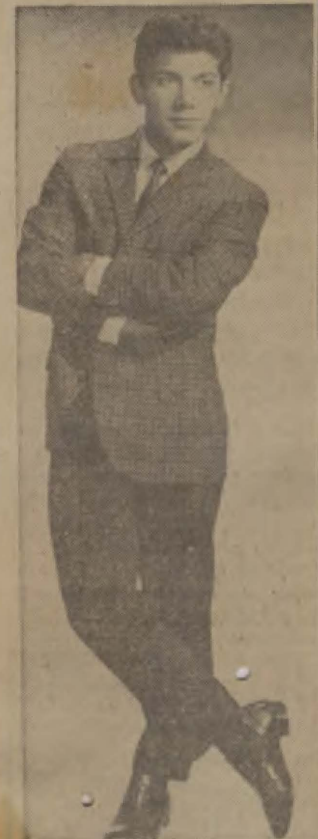
Paul Anka ... a help