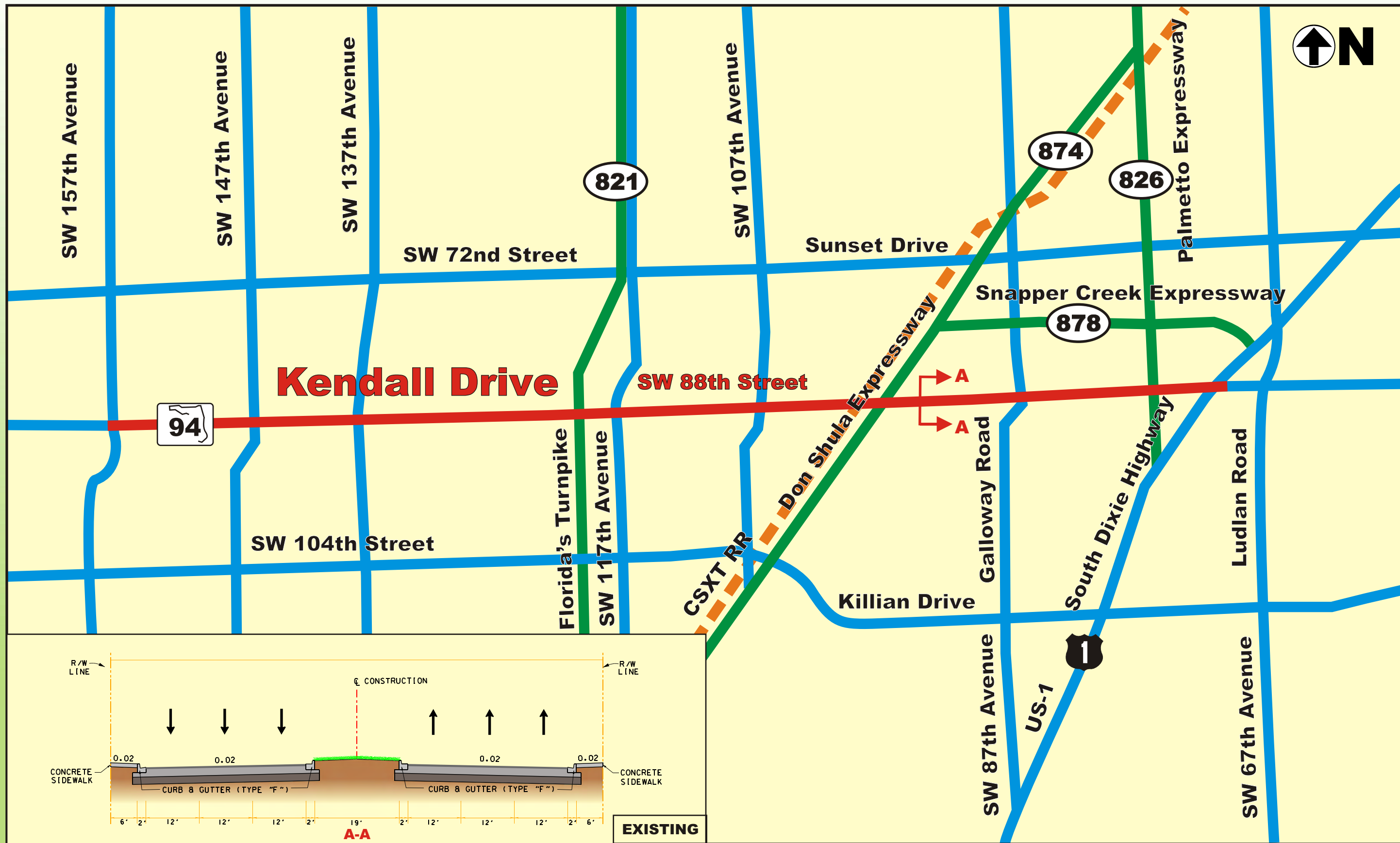
Project Location Map