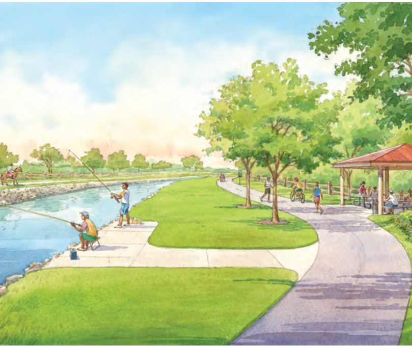
Connecting neighborhoods, creating livable communities

Residences of many cities and counties around the country have experienced benefits associated with trails and linear park spaces. The benefits of trails and open spaces on social, environmental and economic conditions for all residents can be profound and has been documented from Pinellas County, Florida to Portland, Oregon.