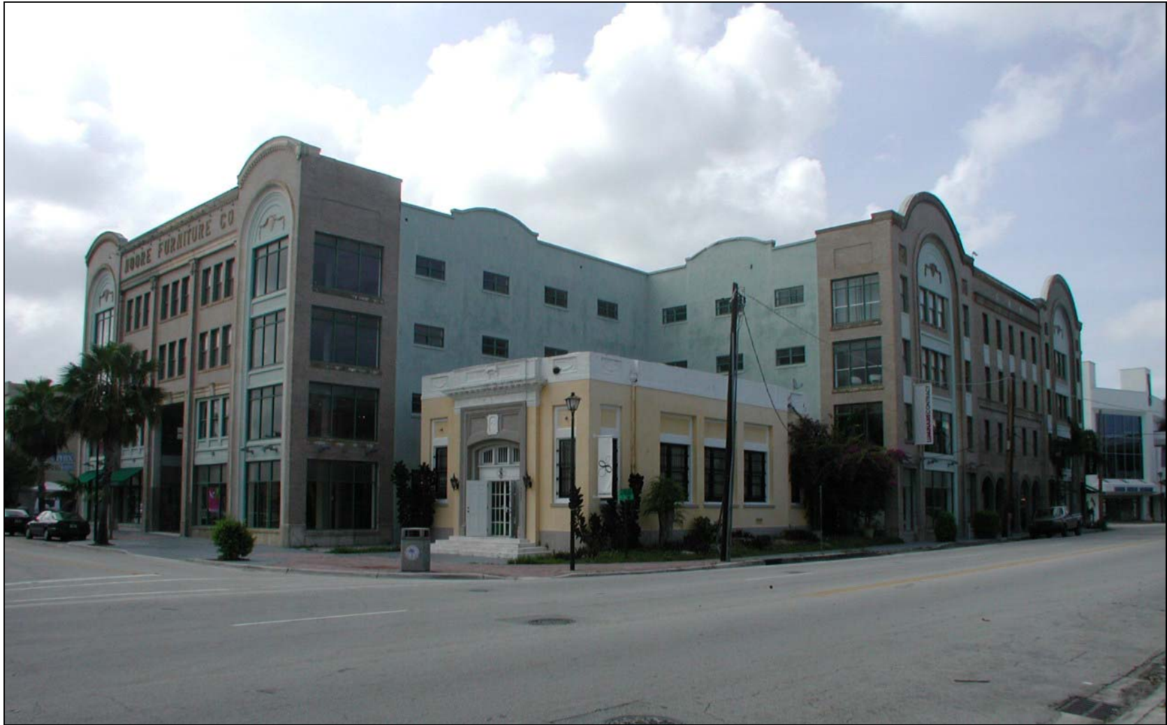
Buena Vista Post Office / Moore Furniture Building 4000-4040 NE 2 nd Avenue Photograph, facing northwest 2003