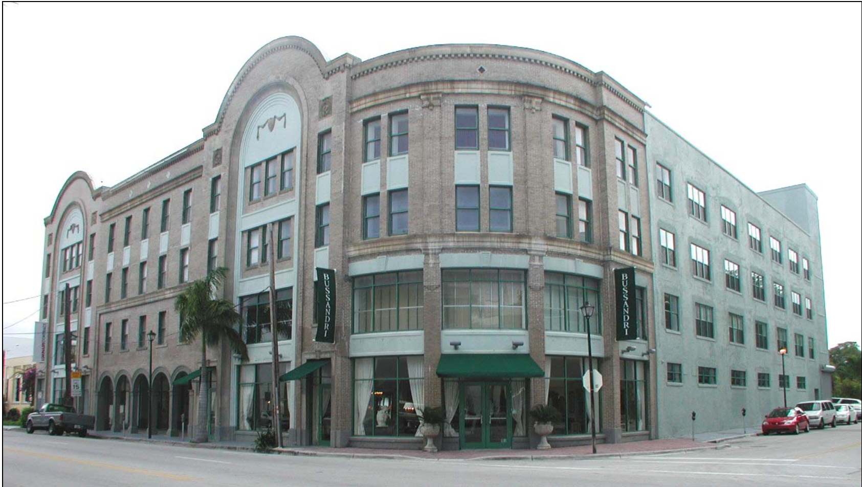
Moore Furniture Building 4040 NE 2 nd Avenue East and north elevations 2003