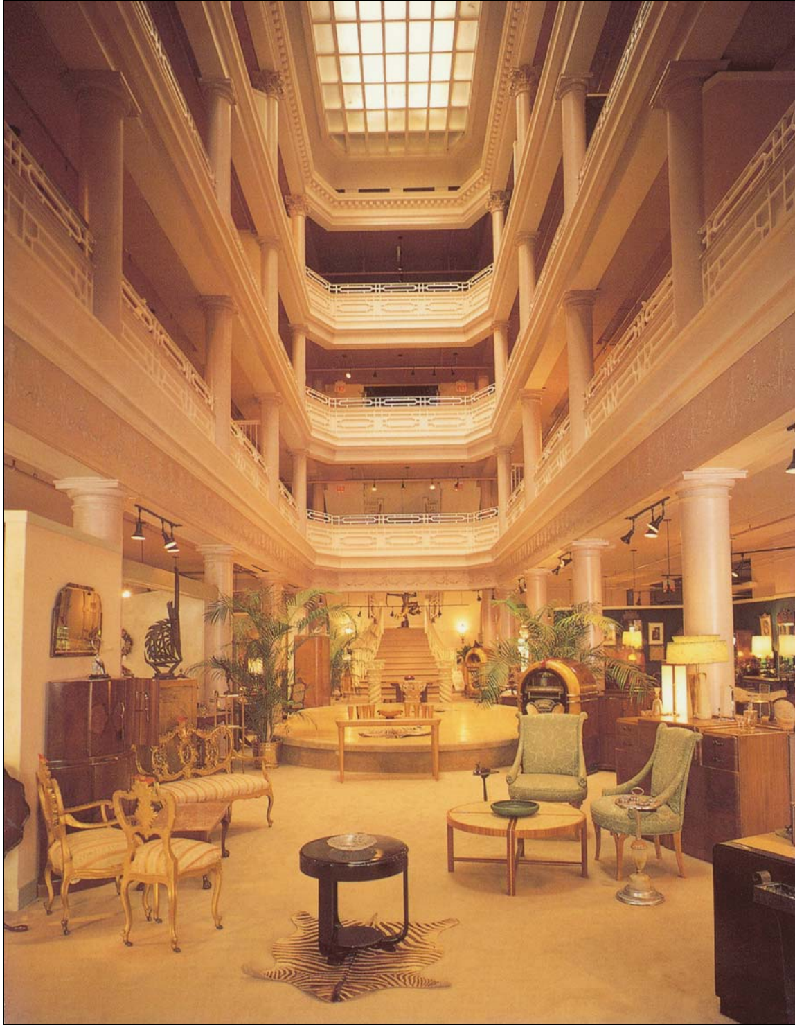
Moore Furniture Building – Interior Atrium and Skylight 4040 NE 2 nd Avenue Facing north Circa 2000