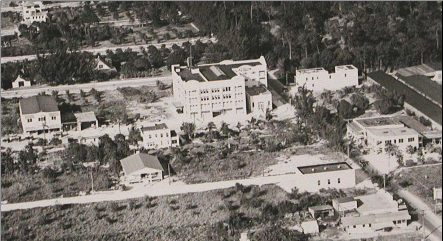
Buena Vista Post Office / Moore Furniture Building 4000-4040 NE 2 nd Avenue Aerial photograph circa 1923, facing northeast