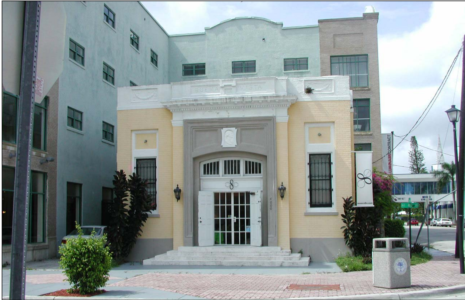
Buena Vista Post Office 4000 NE 2 nd Avenue Photograph, facing north 2003