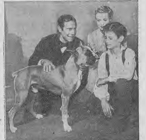
Joe E. Brown, in a role that will surprise you, opens in "The Tender Years" at the Grove Theatre today. Supporting Brown in this warm, human drama are Josephine Hutchinson and Charles Drake.