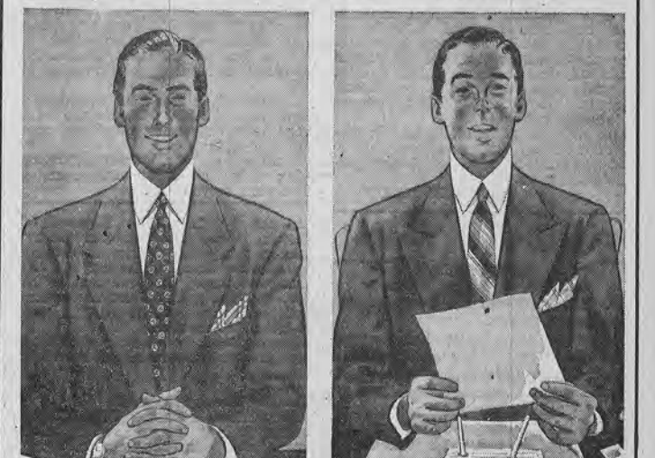
ARROW DART ARROW DALE

SOUTHERN BELL TELEPHONE AND TELEGRAPH COMPANY Incorporated