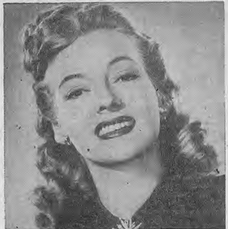
Lovely Evelyn Keyes supplies the romantic interest for Glenn Ford in "The Mating of Millie," comedy drama which opens at the Parkway on Friday, June 18th.