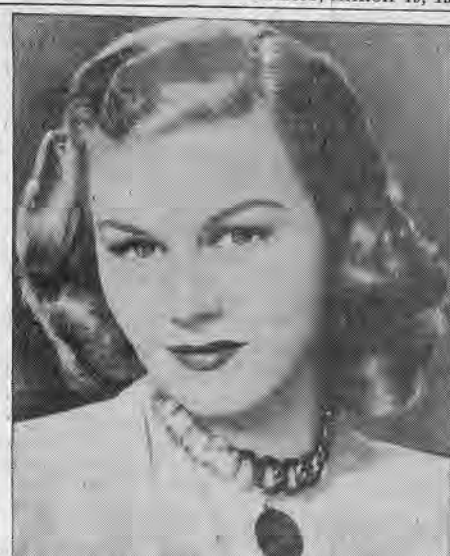
LOVELY JOAN CAULFIELD is starred along with Claude Rains, Audrey Totter, Constance Bennett and Hurd Hatfield in "The Unsuspected," mystery drama opening at the Coral Theater Sunday, March 21st.

Baptist Training Union will meet at the church at 6:30 p. m. Evening worship service will begin at 7:45 o'clock.