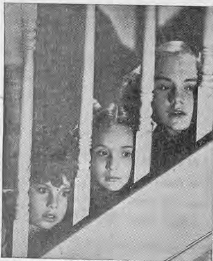
Reading upstairs, Dean Stockwell, Connie Marshall, and Peggy Ann Garner are the three rambunctious moppets who forget that there is a crime and place for everything in the hilarious "Home Sweet Homicide" showing at the Parkway Theatre Friday through Sunday, Nov. 15-17.