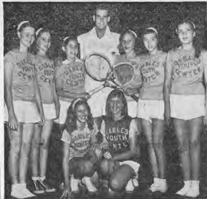
THE CORAL GABLES YOUTH CENTER BALL GIRLS gave Davis Cup player Gardner Mulloy a fond farewell prior to his departure to Australia and the cup matches.

A forest fire travels faster than a deer can run.