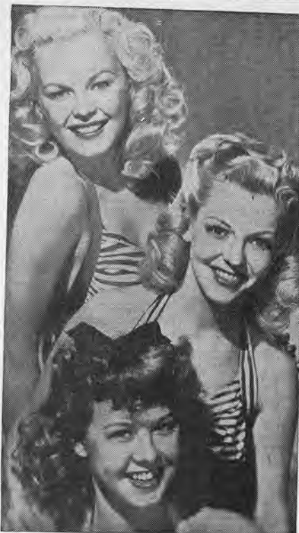
"THREE LITTLE GIRLS IN BLUE"—and Technicolor proves it! The laughter and love filled musical at the Grove Theatre Saturday at 9:30 p.m. and Sunday through Tuesday, November 16-19, stars June Haver, Vivian Blaine, and Vera-Ellen, above. Also in leading roles are George Montgomery, Frank Latimore, and Celeste Holm.

Hair and scalp treatments will be a specialty of the new studio.