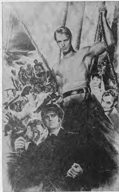
ALAN LADD starring in the film version of "Two Years Before the Mast" now playing at the Gables Theatre.

The Navy estimated that the Women's Reserve replaced more than 50,000 men for sea duty in World War II, enough to man a major task force.