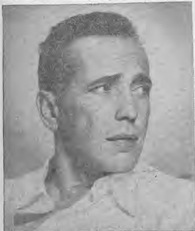
HUMPHREY BOGART and LAUREN BACALL are co-starring in the film story "The Big Sleep" playing Sunday and Monday at the Coral Theatre.