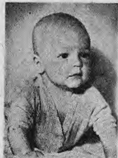
BABY PICTURES BY

2303 Ponce de Leon Blvd. CORAL GABLES Telephone 48-2327