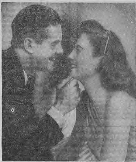
ROBERT CUMMINGS and Barbara Stanwyck are shown in a scene from "The Bride Wore Boots" which will be shown Sunday and Monday at the Coral Theater.