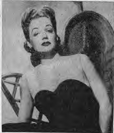
ANN SHERIDAN plays opposite Dennis Morgan in "One More Tomorrow," which plays through Monday at the Gables Theater.

In addition to these types of policies the amendment provides for 20-year endowment policies, endowment at the age of 60 and endowment at the age of 65. On all of these endowment policies the premiums must be paid for the in-