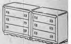
Twin Chests - Each $39.75

ROYAL PALM FURNITURE FACTORIES, INC. 1301 N. W. 7th AVENUE PHONE 3-5754