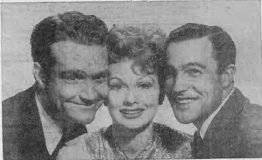
RED SKELTON, LUCILLE BALL and GENE KELLY are stars of the new M-G-M technicolor musical, "Ziegfeld Follies of 1946," which also stars William Powell, Fred Astaire, Judy Garland and Ester Williams. The picture opened, yesterday and plays through Sunday at the Gables Theater.

In addition to the Jaycees, Embury-Riddle and the Biltmore teams, others signing up for the