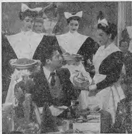
JUDY GARLAND and JOHN HODIAK are co-starred in "The Harvey Girls," which will be shown Sunday and Monday at the Coral Theatre.