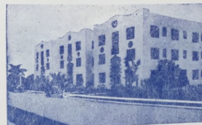
ATLANTIC COURTS 2000 S. W. 29th St.