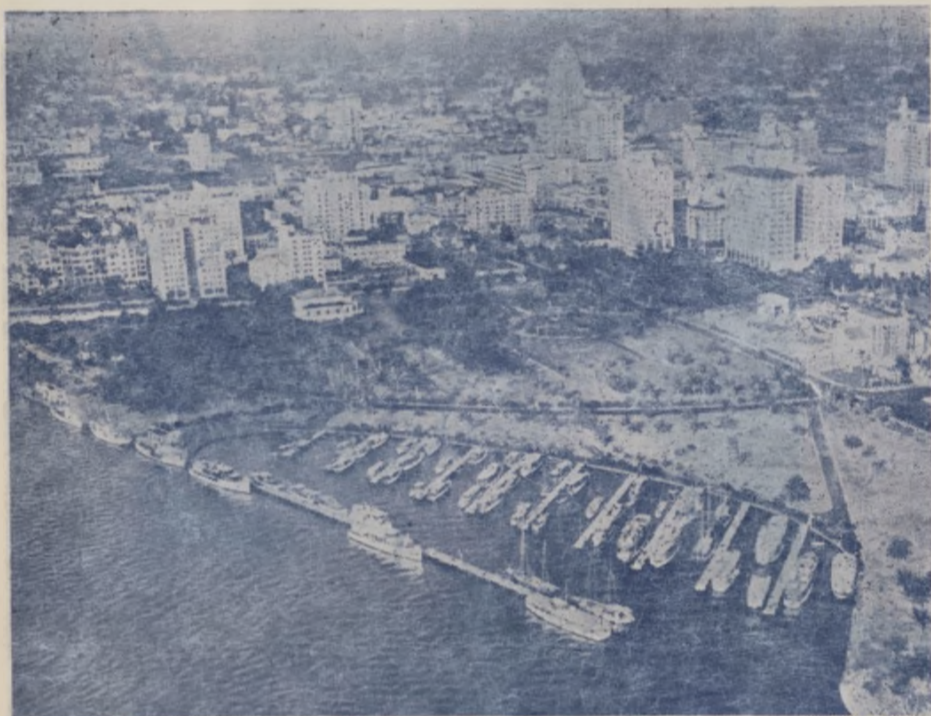
ROYAL PALM DOCKS—BISCAYNE BAY