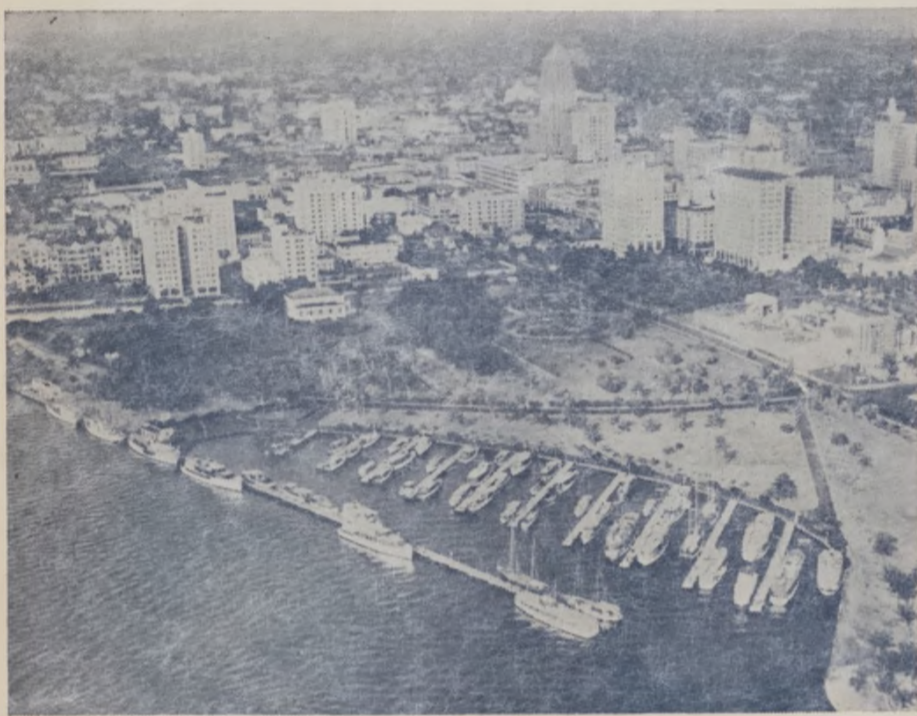
ROYAL PALM DOCKS—BISCAYNE BAY