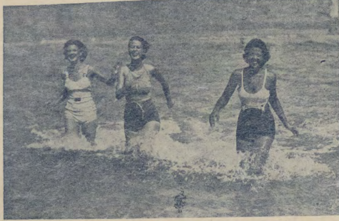
TEACH US TO SWIM, PLEASE

Greater Miami is the foremost winter resort in the United States. It soon will become the Year-Around Playground of the Americas. With summer rates in effect, northern visitors are induced to keep their rendezvous with health and happiness longer in palm-studded Miami. They find this added sojourn more inviting than flirting with pneumonia above the Mason-Dixon line.