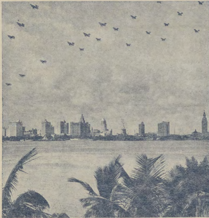
"YOUR SKYLINE REMINDS ME OF NEW YORK"

Yachting, golf, surf-bathing, sail-fishing, tennis and out-door sports galore are more appealing in May. Gone the turmoil of the winter-season giving a chance for relaxation. The mean May temperature is 82.5 degrees. No May reading ever exceeded 90. Hotels, apartments, restaurants and business concerns have slashed their prices to induce you to Stay-Thru-May, if now here, or take a train south from wherever you are.