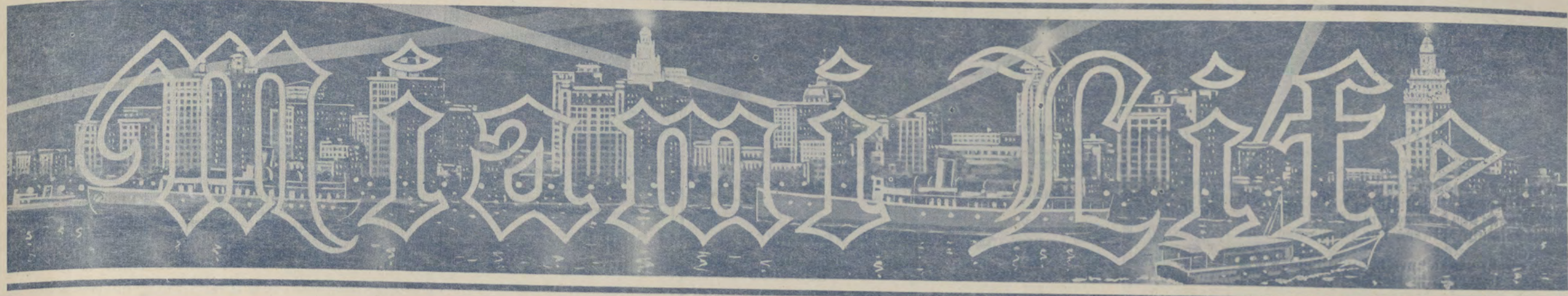
"YOUR SKYLINE REMINDS ME OF NEW YORK"