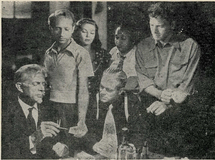
Burt Lancaster and Dan Duryea plot a daring robbery while Yvonne deCarlo looks on in this scene from "Criss Cross," showing Tuesday and Wednesday, February 7 and 8 at the Lauderdale Drive-In Theatre.