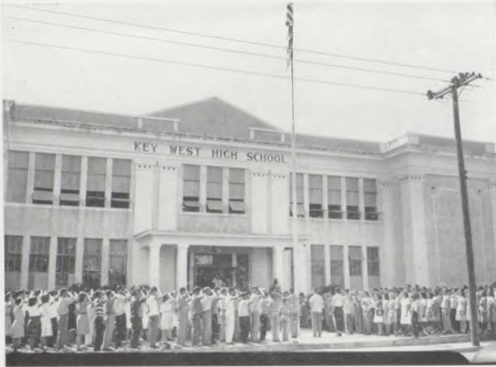
"KEY WEST HIGH SCHOOL FLAG CEREMONY"

Key West High School Is the Southernmost School in the United States