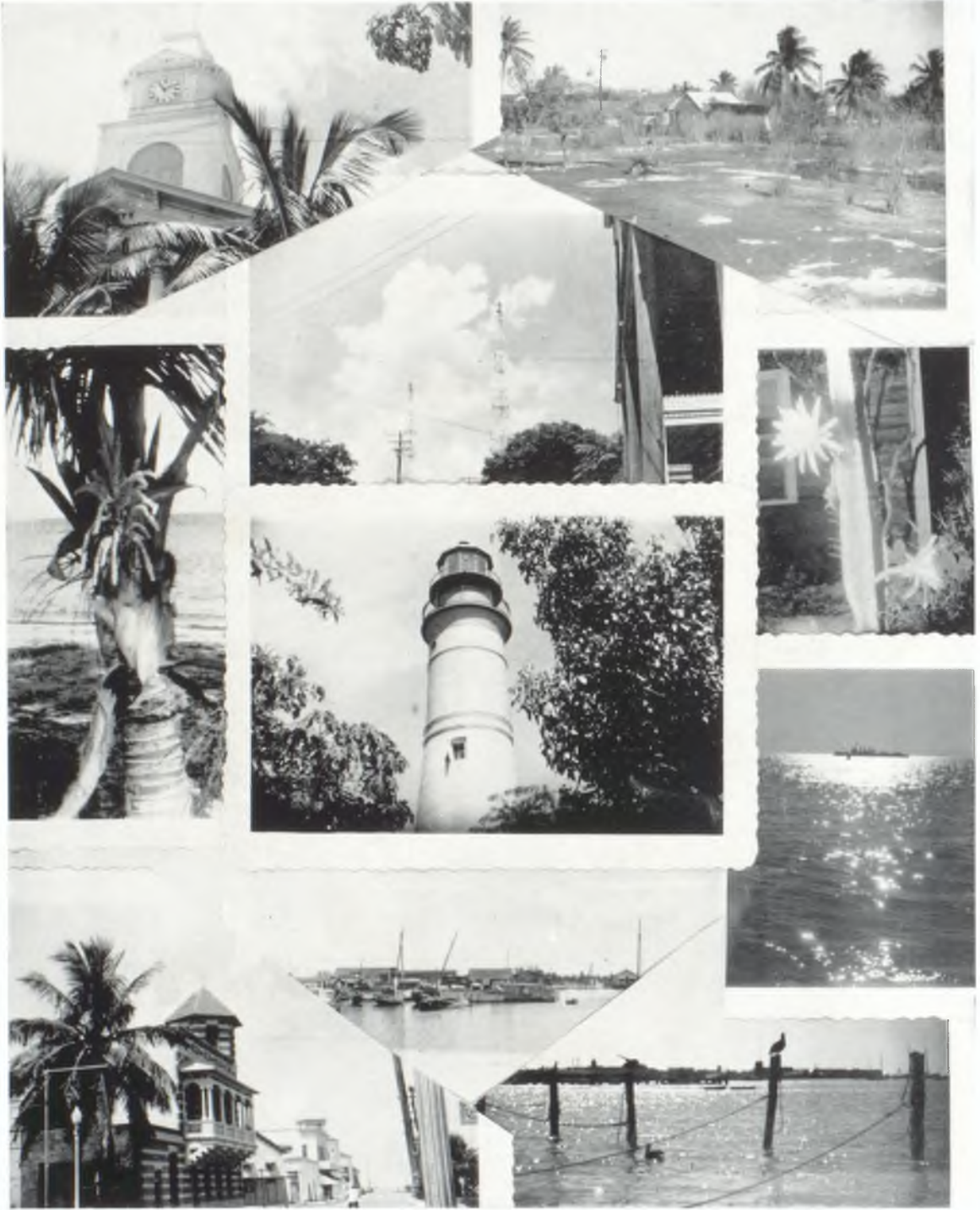
OUR TOWN—Courthouse Clock; Rock and Palms; Budding Spring; Clouds; Old Faithful; Wonder of the Night; Asleep in the Harbor; The Bank; Fisher Boats at Rest; Sentinels!