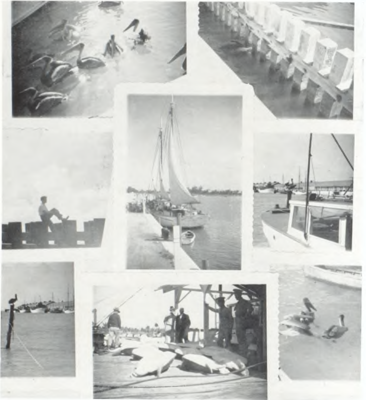
KEY WEST ON PARADE—Pelicans Fishing; Turtle Crawl; Silhouette; Anchors Aweigh; Out to Sea; Distant Docks; Old Timers; Headin' for Shore.