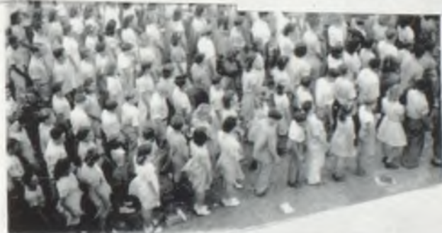
SCHOOL SHOTS—Old Glory; Our Honorable Opponents; Scarlett and Rhett; Guys and Gals, mostly Guys; Junior-Senior Promenade; Hurrah! Free Balloons; End of a Perfect (?) Day; At-ten-shun!