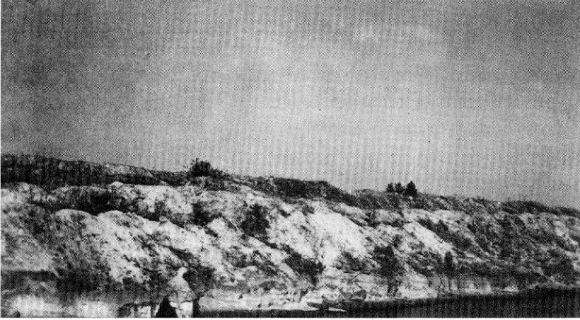
View of the high banks of Fox's Cut in Flagler County, 1915. The Florida canal company dredged this and other 'dry' cuts between the Matanzas and Halifax rivers for thirty years, off and on, from 1882 until 1912.