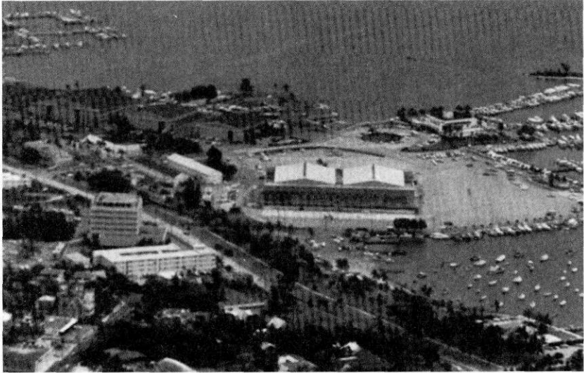
Coconut Grove's Dinner Key was an important aviation venue and, later, the site of Miami's city hall.

The first outright conflict between Miami and Coconut Grove came just after World War I. During the war, the federal government built a