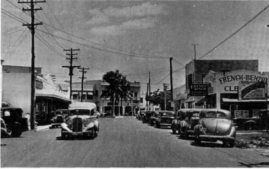
Main Highway approaching McFarlane Road—Grand Avenue. The intersection of these three arteries represented the business center of Coconut Grove.

the City Commission that the best possible way to handle the situation would be to create a new department of the city to be known as the Department of Coconut Grove, as well as to create other departments for handling the affairs of other towns and communities taken into the city, and to place at the head of the Department of Coconut Grove the present city manager of