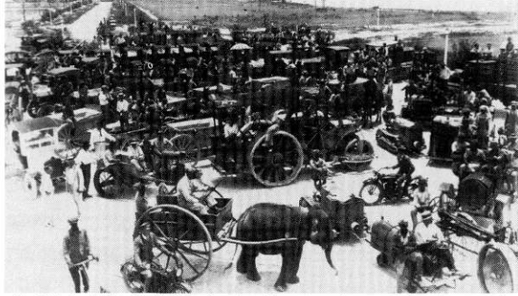
Carl Fisher's Rosie the Elephant and construction equipment appearing in front of the future site of Miami Beach's Nautilus Hotel.

These stories about soaring land values fed the Miami fever and encouraged increasing numbers of Americans to pour their retirement savings into Florida real estate. 18 Parallel to the land speculation, the news spread