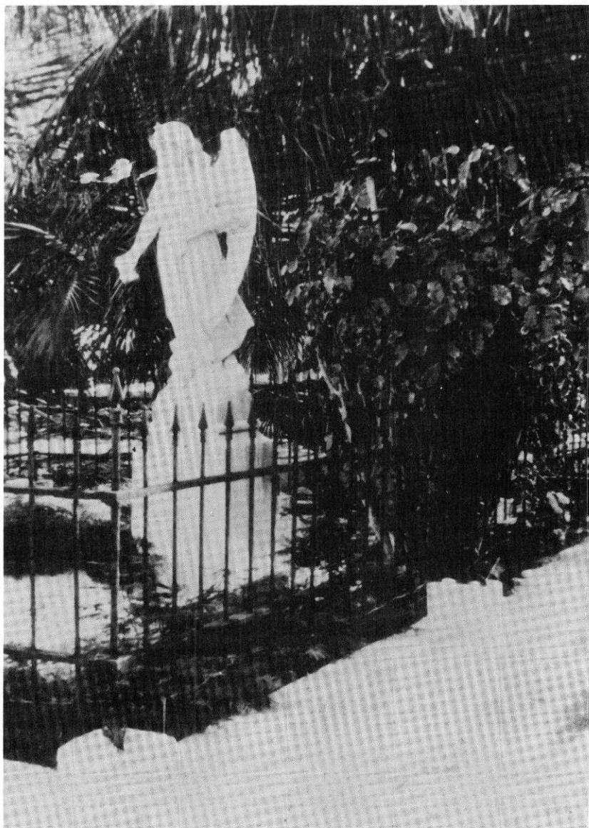
Angel before 1935 hurricane.