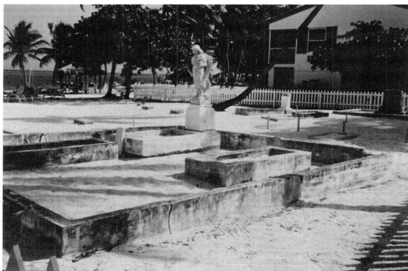
Wooden markers re-established burial sites. Notice angel with broken wing.