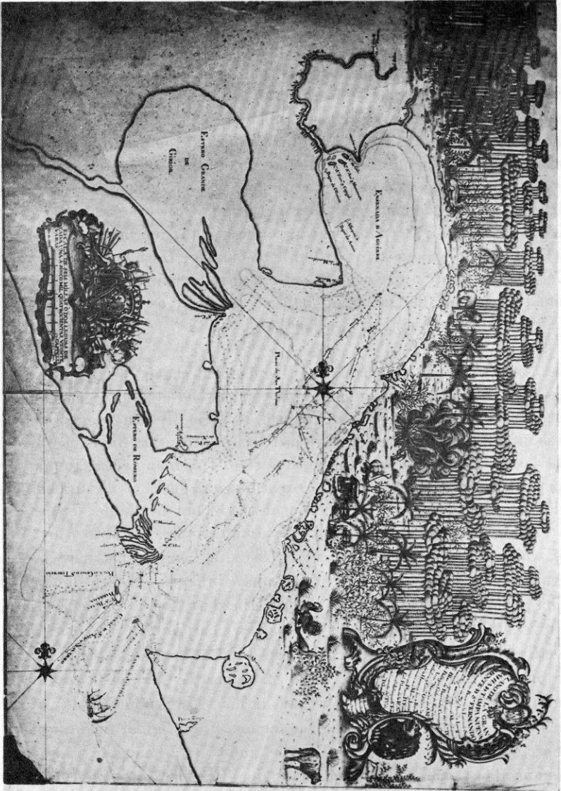
No. 2 — Celi Imitation Map