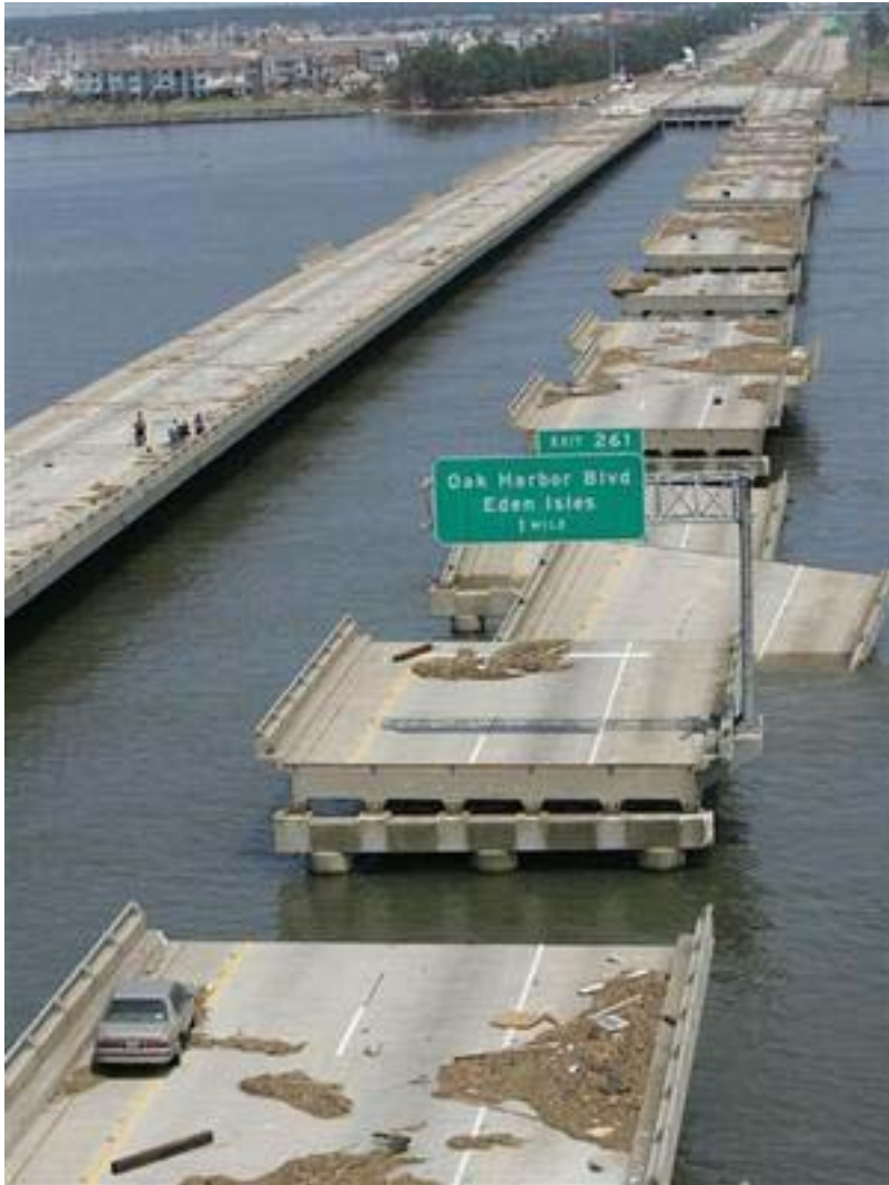
Figure 4: I-10 Bridge over Lake Pontchartrain, Louisiana, after Hurricane Katrina, 2005