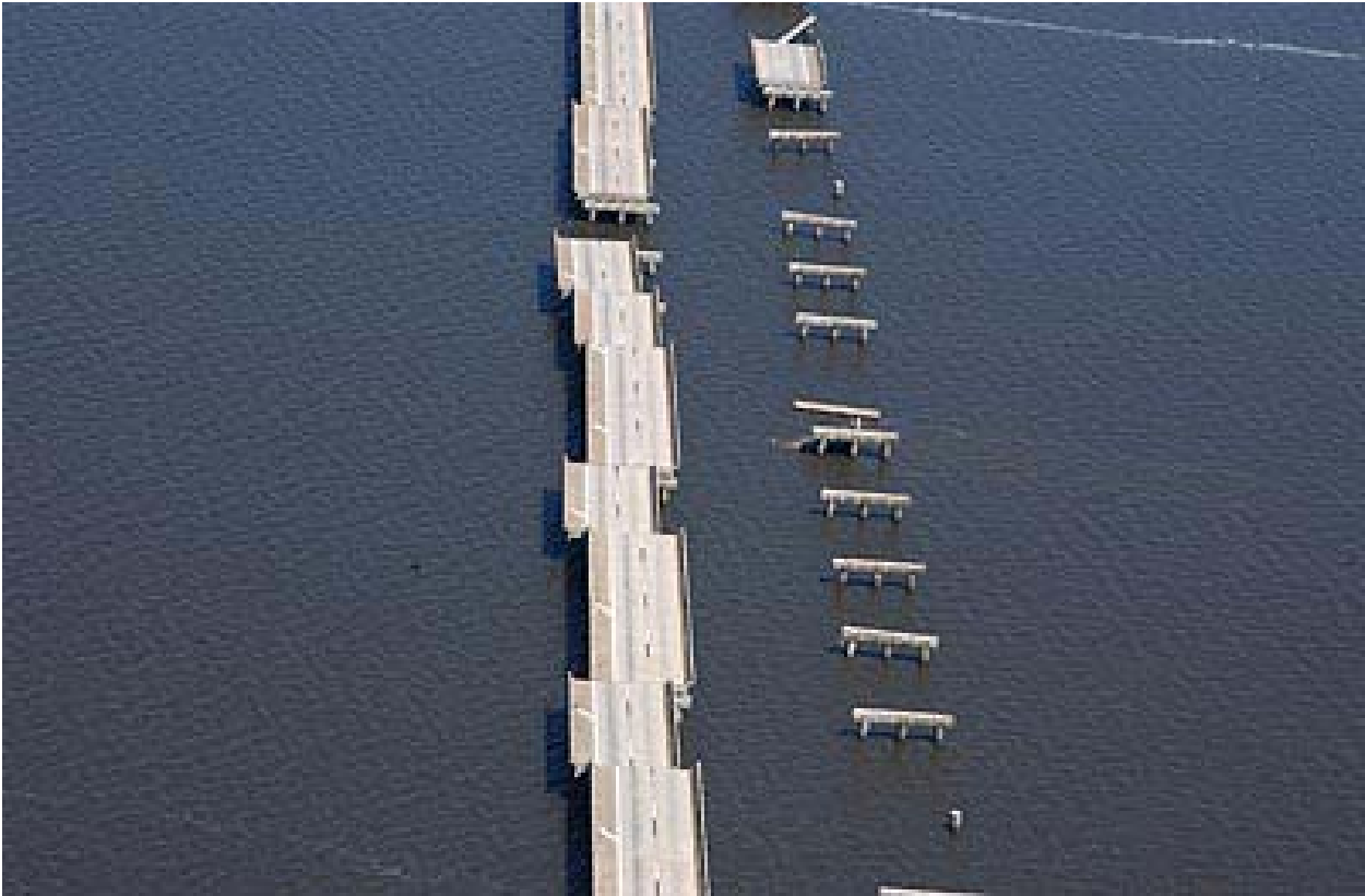
Figure 3: I-10 Bridge over Escambia Bay, Florida after Hurricane Ivan, 2004