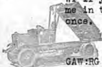
DUMPING UNITS FOR MOTOR TRUCKS