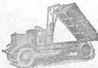
DUMPING UNITS FOR MOTOR TRUCKS