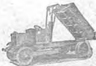
DUMPING UNITS FOR MOTOR TRUCKS