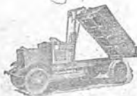
DUMPING UNITS FOR MOTOR TRUCKS