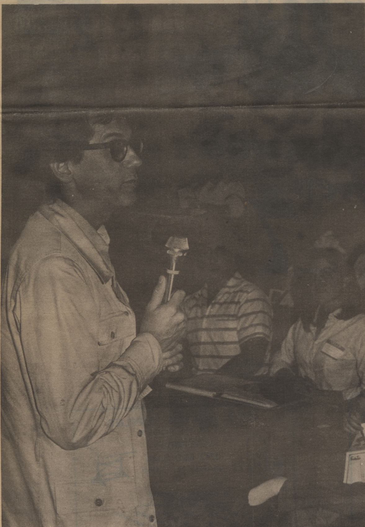
Christo, seen here talking to FIU students in the Fall of '82, begins his island wrapping project this week.