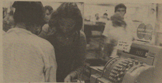
STUDENT MAKES PURCHASE AT BOOKSTORE.

Assuming that there will be a demand for a book the following term, a student may buy a new book and sell it back at 50 percent of the new price. If he buys a used book, he buys it at 25 percent off and sells it back at 50 percent of its original price, a savings of 75 percent. Yet, a relatively small percentage of students sell used books.