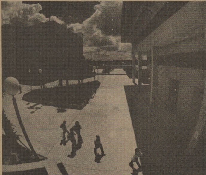
Jets used to circle for landings over this spot. But now the old Tamiami airport bustles with academic life. Here comes Florida International University, expanding down the runway.