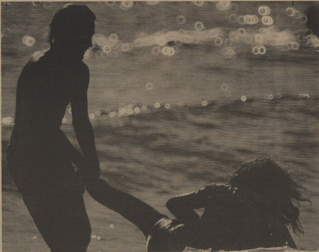
Frolicking in the foam.