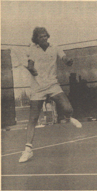
Payne shows style.