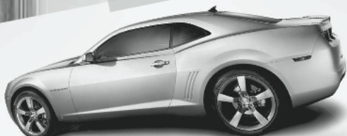
All New Chevy Camaro

YOU CAN SAVE HUNDREDS, EVEN THOUSANDS, WITH THE GM COLLEGE DISCOUNT.