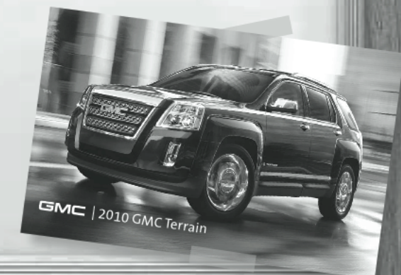
GMC | 2010 GMC Terrain

Get your college discount price and register at gmcollegediscout.com/FIU