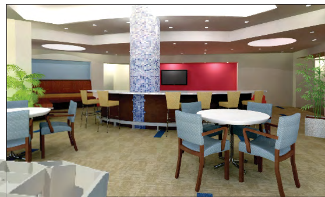
ILLUSTRATIONS COURTESY OF DALE GOMEZ

Gomez explained some ways Microsoft Surface is already in use in the hospitality industry offering