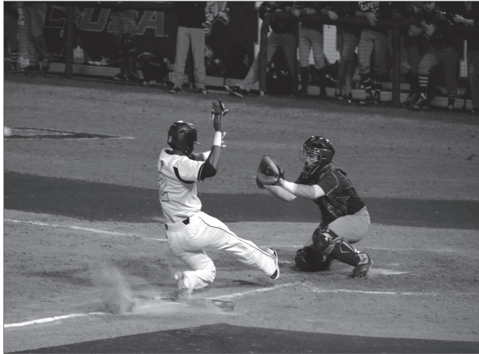
KRONO LESCANO/THE BEACON

Also, FIU is 26th in the nation with 78 runs scored, 46