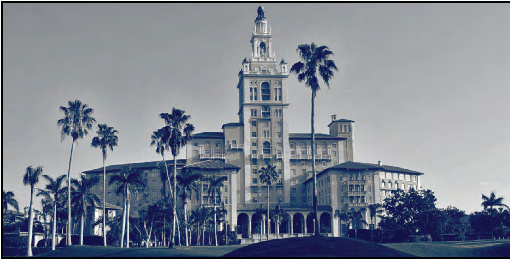
Photo of the historic Biltmore Hotel in Coral Gables, FL.