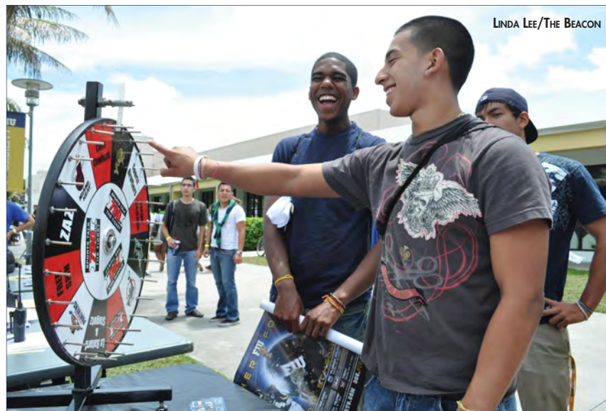
Students enjoy an outdoor game during a Week of Welcome event in the fall.