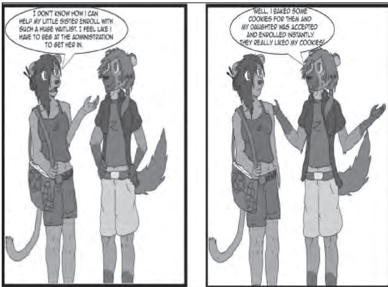
ILLUSTRATION BY GIOVANNI GARCIA/THE BEACON