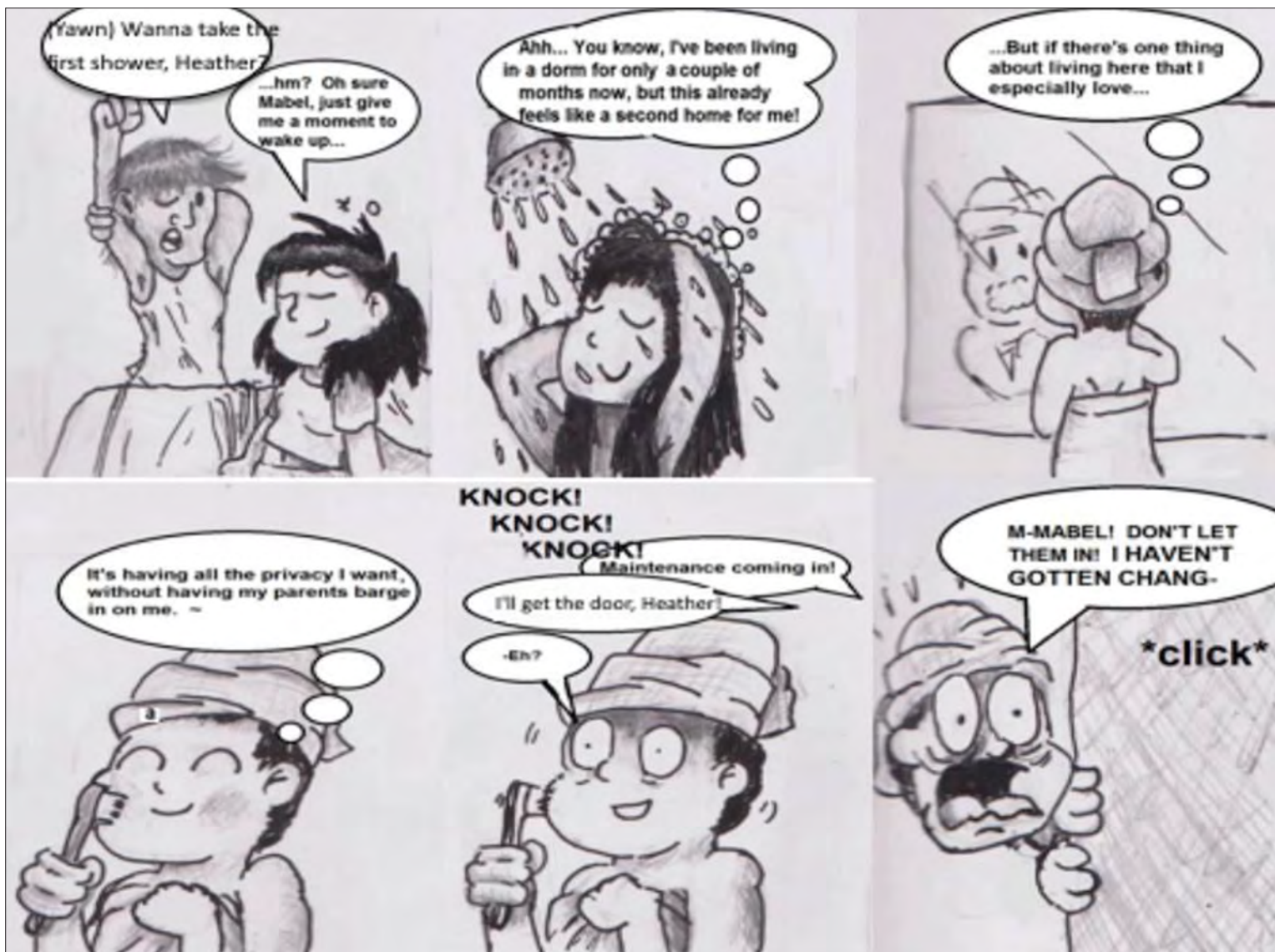
ILLUSTRATION BY CHRISTIAN SPENCER/THE BEACON

The problem arises when students are notified that maintenance technicians are allowed