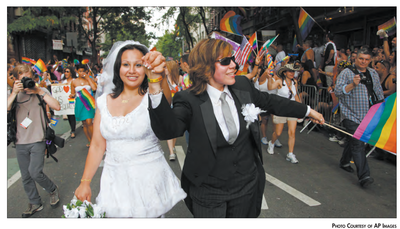
The law signed by NY Gov. Andrew Cuomo led to a celebration during the annual Gay Pride parade in Greenwich Village.

Twenty-nine Democrats and four Republicans voted yes on the bill, which will take effect 30 days after it's