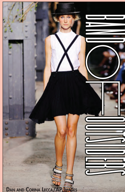
BAND OF OUTSIDERS

Haute Topic is a weekly fashion column. Look for it every Wednesday.