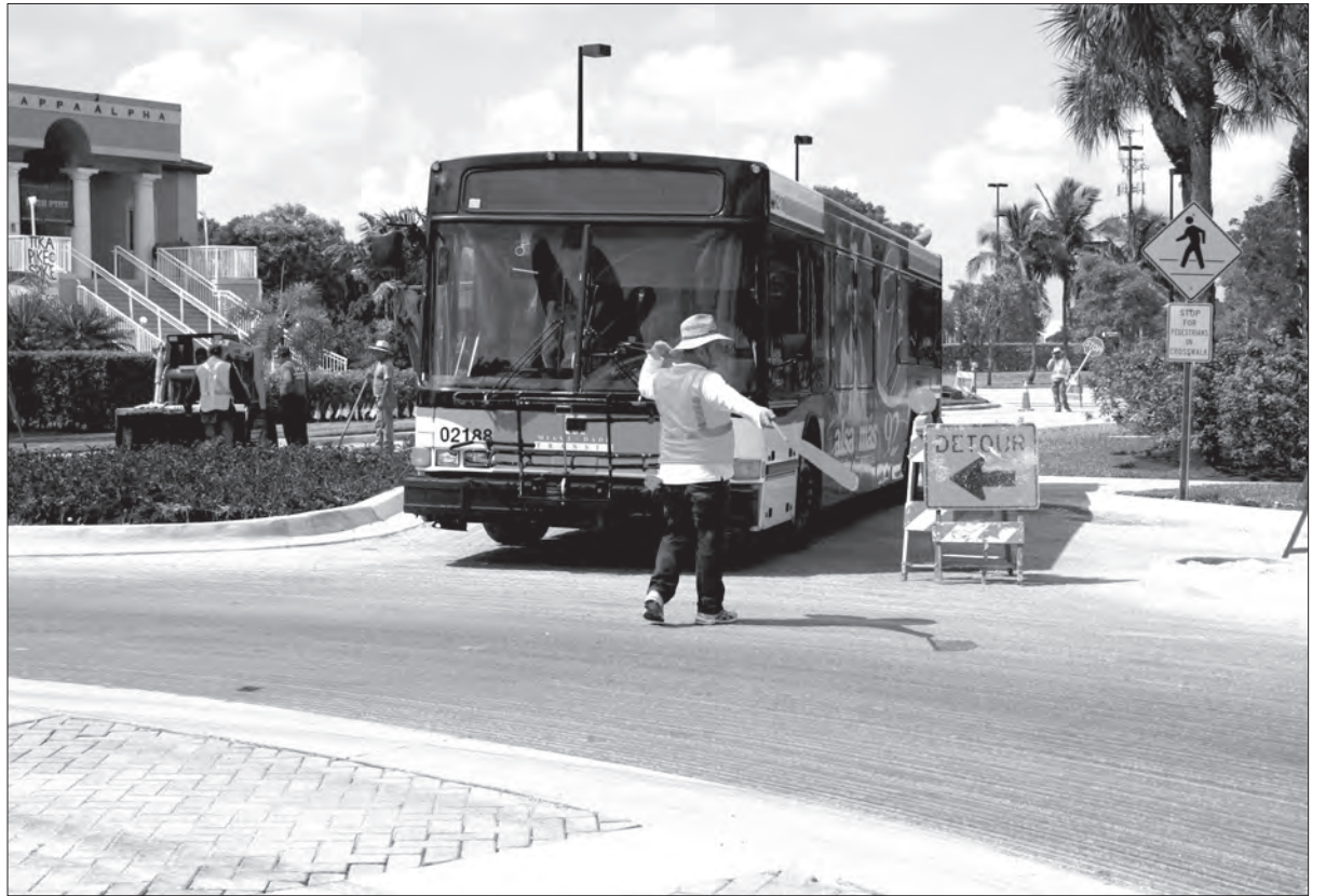
MELHOR LEONOR/THE BEACON

Construction worker directs traffic Friday, July 6 near the main east entrance of the Modesto Maidique campus due to undergoing renovations at the traffic circle to "enhance safety."