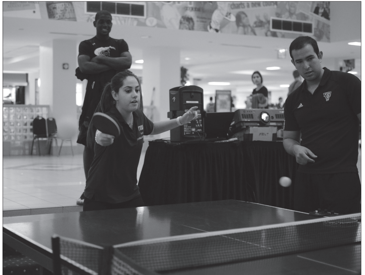
ROBERTO JIMENEZ/THE BEACON

GC is sponsoring table tennis to fundraise for uniforms and bring more awareness. One fundraising technique they use is putting a table tennis machine in the GC pit that lets you practice